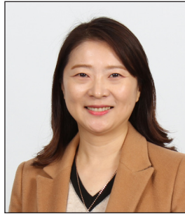
Han Kyu-un Safety and Occupational Health Office