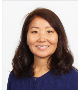
Puujee Cline Internal Review Office