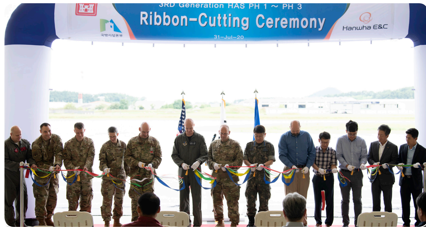
Leaders from the 8th Fighter Wing, Hanwha Engineering and Construction, Far East District, and the Republic of Korea Ministry of National Defense, cut a ribbon inside a new hardened aircraft shelter on Kunsan Air Base, Republic of Korea, July 31, 2020. The ribbon-cutting marks the completion of 20 new aircraft shelters built on Kunsan's flightline.

The HAS’s have ventilation and engine exhaust systems to allow aircraft engines to run inside the shelter with the hangar doors closed. It also has new fire prevention systems and improved storm drainage systems, along with other safety features. This provides an upgraded protection area for Kunsan’s fighters, and a safer working environment for Airmen.