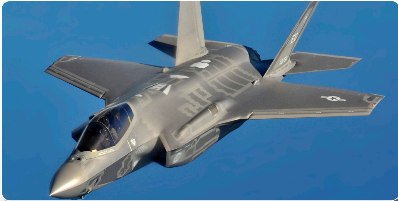
The F-35 Lightning II is a 5th Generation fighter, combining advanced stealth with fighter speed and agility, fully fused sensor information, network-enabled operations and advanced sustainment. Three variants of the F-35 will replace the A-10 and F-16 for the U.S. Air Force, the F/A-18 for the U.S. Navy, the F/A-18 and AV-8B Harrier for the U.S. Marine Corps, and a variety of fighters for at least ten other countries.

This project has kept the vision of the district to be the trusted engineers on the peninsula as focused professionals delivering quality, engineering excellence, and driven to exceed expectations.