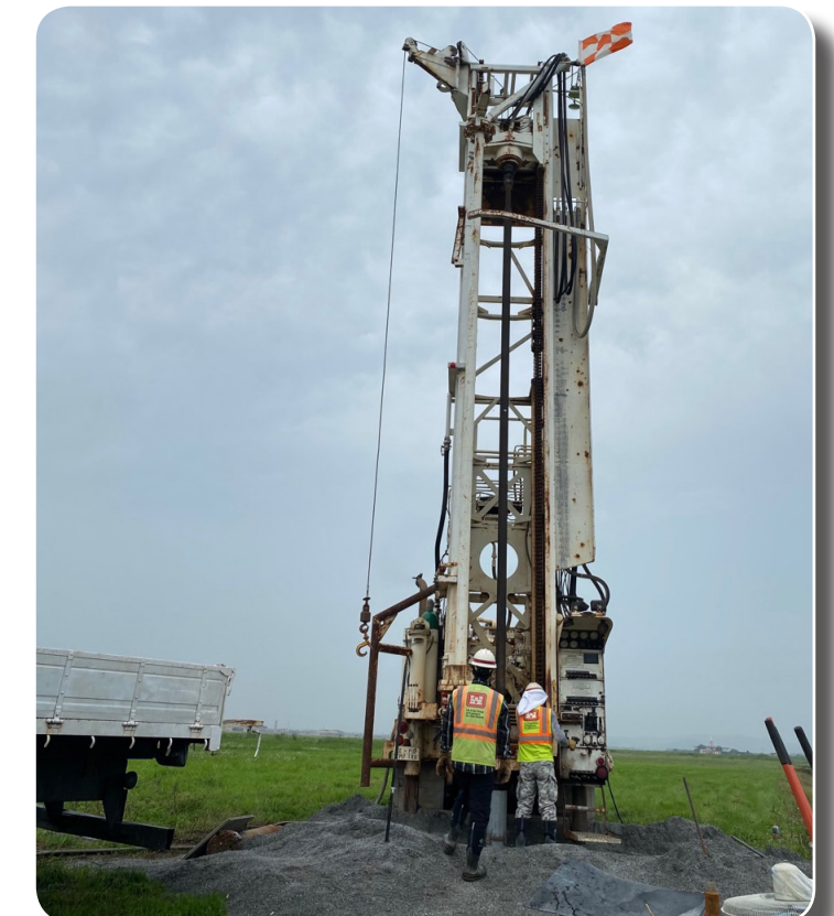
FED is one of nine districts within the U.S. Army Corps of Engineers with this unique drilling and sampling capability.

This daunting task also falls within the Far East District's exceptional internal proficiencies as they are one of nine districts within the U.S. Army Corps of Engineers with this unique drilling and sampling capability.