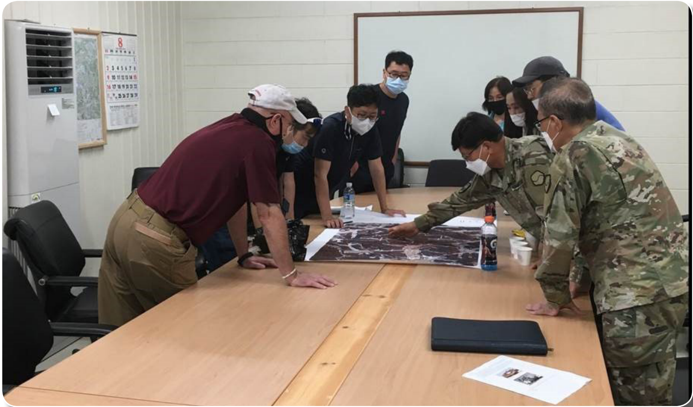
Design branch and FED Engineering division conduct recon at Story ranges using ENFIRE with Training Support Activity Korea.

or a human being treated properly. Finally, I saw how both engineering and nursing value the needs of others and put those first, whether that be in constructing a gymnasium to harness the equipment necessary for a beneficial exercise environment or adopting a patient-first philosophy in practice. I am grateful to those I interacted with and learned from and am excited to apply my new skills and lessons to the healthcare field in my future.