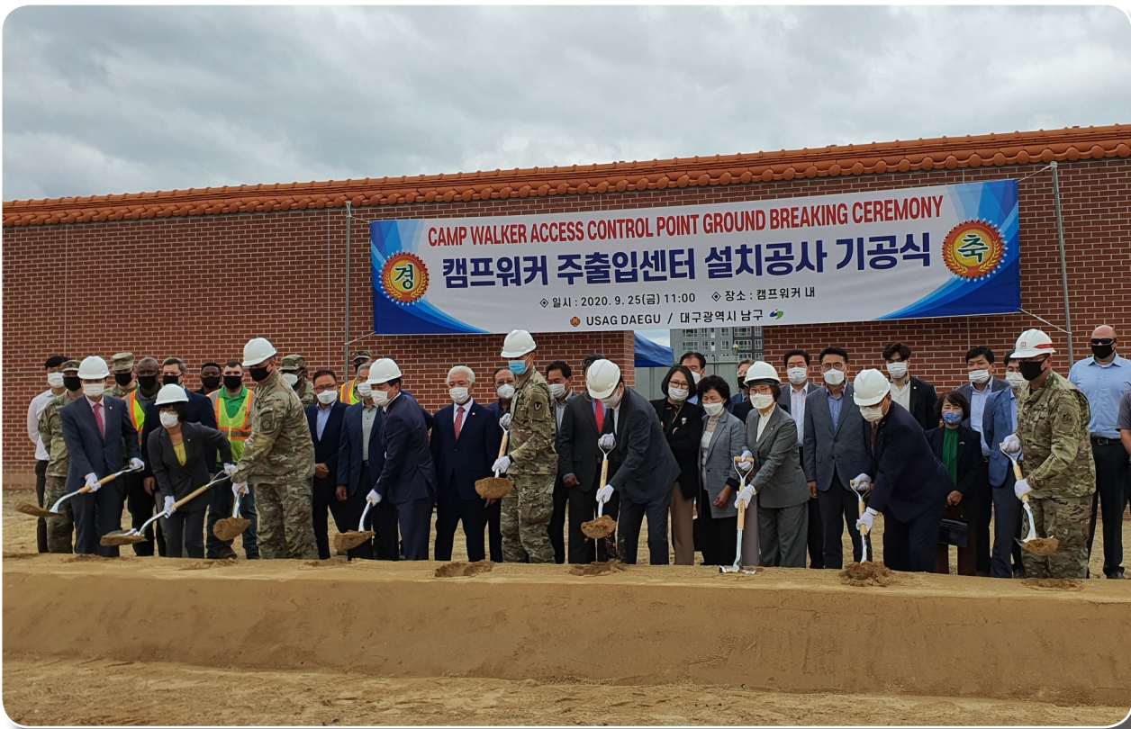
U.S. Army Corps of Engineers Far East District Commander Col. Chris Crary and other dignitaries participate in the Camp Walker access control point groundbreaking ceremony on Sept. 25.