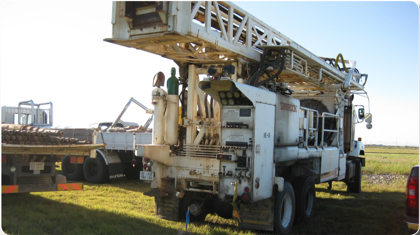
Far East District's only water well drill rig. In July, a brand new rig will join the fleet.

Much of the water used on Camp Humphreys comes from ground water wells. Water well locations pump out water and send to water treatment plants and then to water storage tanks on the installation. FED geotechnical and environmental engineering branch evaluates the water quantity and quality in house. Water well maintenance is typically conducted once a year by FED engineers, geologists and well crews and the district also provides support within 24 hours of an emergency.