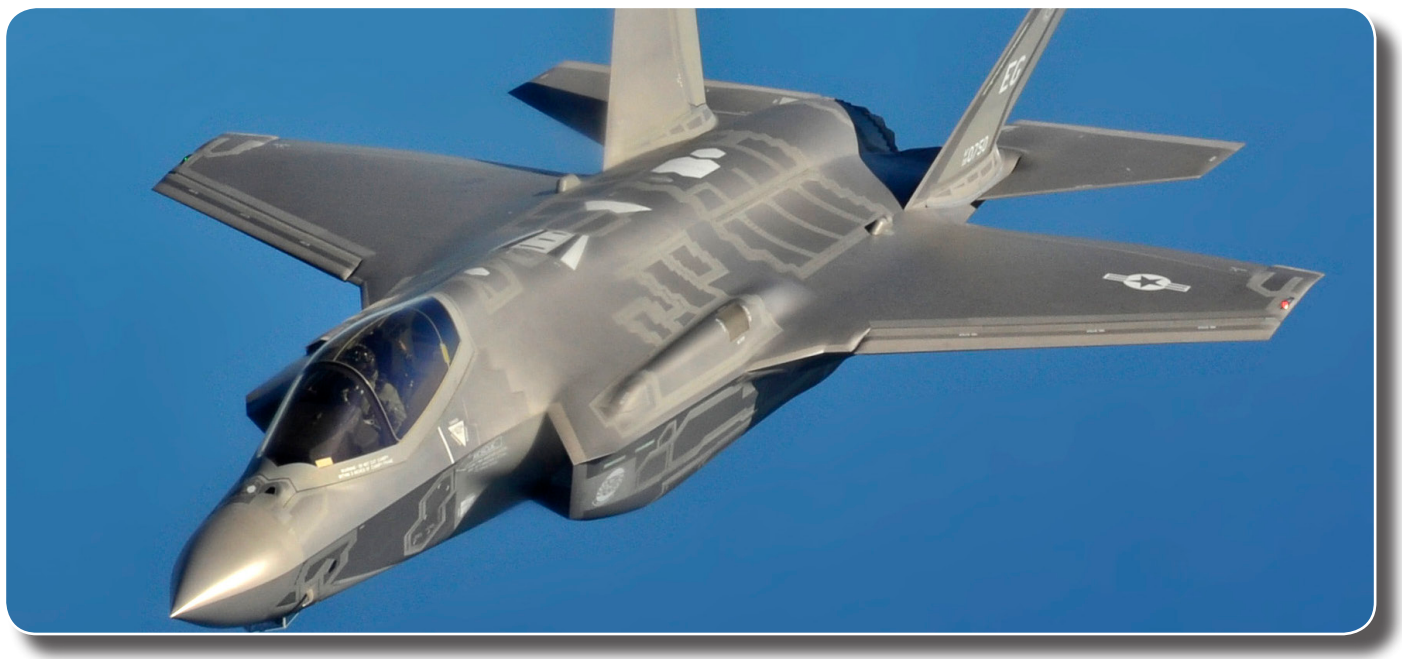
The F-35 Lightning II is a 5th Generation fighter, combining advanced stealth with fighter speed and agility, fully fused sensor information, network-enabled operations and advanced sustainment. Three variants of the F-35 will replace the A-10 and F-16 for the U.S. Air Force, the F/A-18 for the U.S. Navy, the F/A-18 and AV-8B Harrier for the U.S. Marine Corps, and a variety of fighters for at least ten other countries.

every aircraft. Missions that were traditionally performed by small numbers of specialized aircraft, such as intelligence, surveillance and reconnaissance and electronic attack missions can now be executed by a squadron of F-35s, bringing new capabilities to many allied forces.