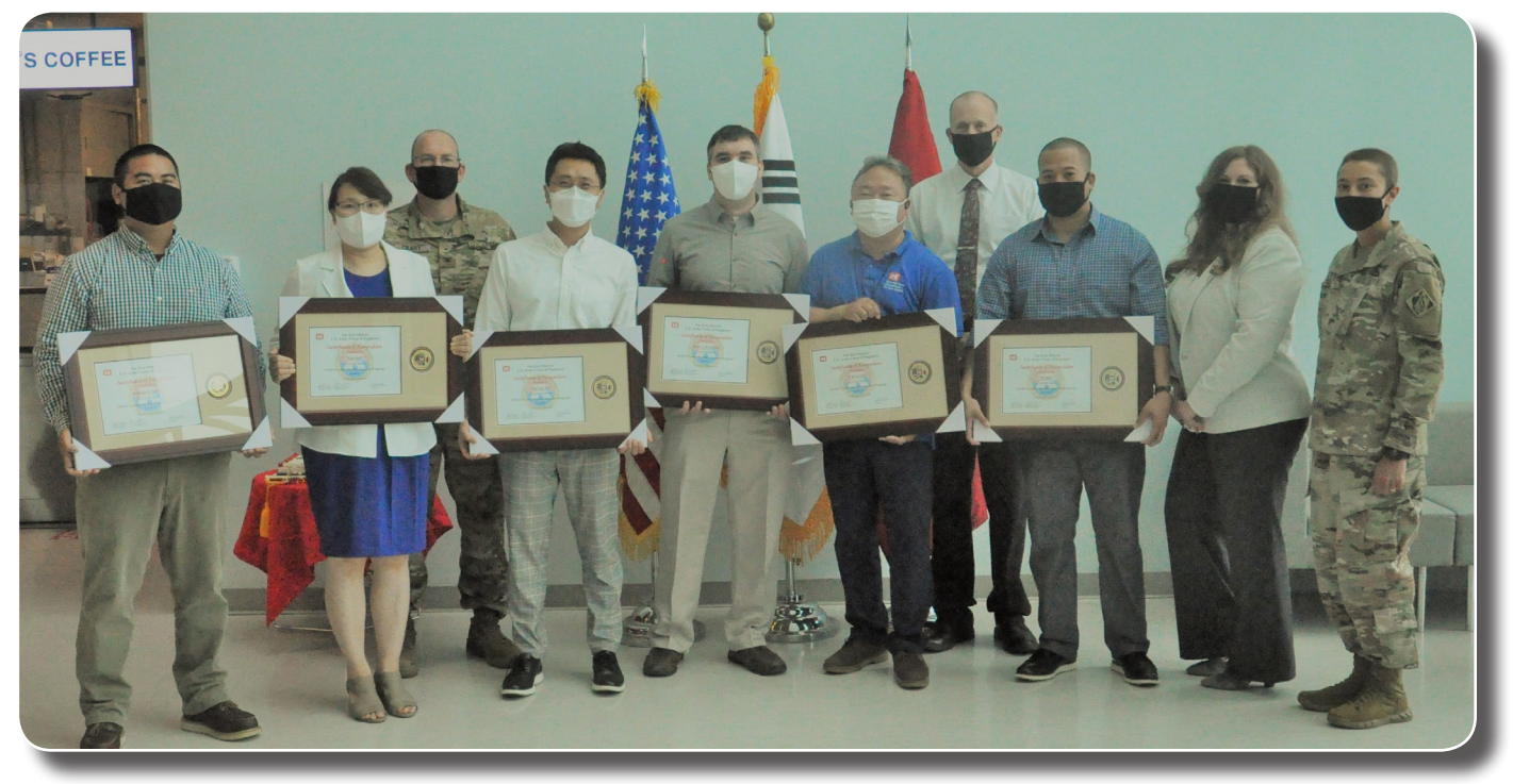
The Far East District USACE Leadership Development Program (ULDP) class of 2020 was recognized on their graduation July 8 at the district headquarters. The team consisted of six GS-12 and KGS-11 employees from various career fields and was named WIP6, which stands for "Work in Progress 6." The group completed a 14 month program to enhance and develop their skills as leaders. The USACE Leader Development Program level 2 is the District level, competitively selected, cohort-based leader development program targeted at emerging leaders at the GS/KGS-12 and below level.

The group completed experiential team activities such as a FED scavenger hunt, a leader reaction course at Camp Humphreys, as well as classroom instruction through Defense Acquisition University (DAU) led seminars and discussions on topics including emotional intelligence, effective followership, and knowing and leading self.