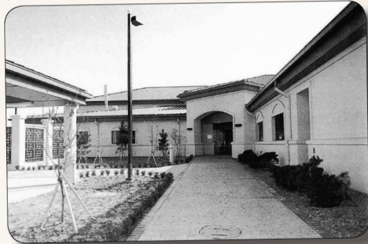
The new community activity center at Camp Humphreys opened for business, January 15, 1999.