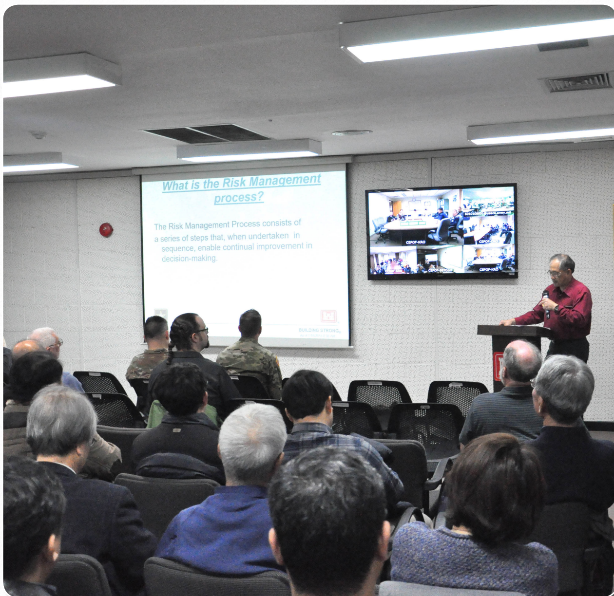
United States Army Corps of Engineers, Far East District employees attend face-to-face training at the district's East Gate Club, Jan. 18. The topics covered during the training were winter driving safety, risk management, suicide prevention, the Army substance Abuse Program, and ethics training.