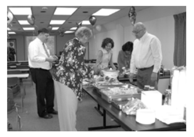
Setting up the serving tables

The plan was to judge the chili on five criteria from the Chili Appreciation Society International (CASI): color, aroma, consistency, taste, and aftertaste but because there were just three contestants no ranking was determined.