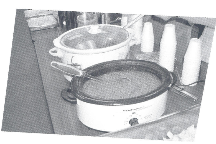
Chili not purchased with any appropriated funds.

One of the most obvious characteristics of Hispanic culture is passion. They have a passion for the food, the music and their dance. On October 14, 2004, members of the Far East District gathered and enjoyed the food and the culture with Hispanic music in background to celebrate the first FED Hispanic Heritage Day. And of course the food was Chili.