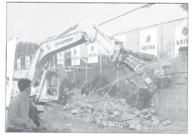
The wall between Yongsan Garrison and Ministry of National Defense is demolished in preparation for new helipad construction.

The East Gate Edition is an authorized publication for members of the Far East District, U.S. Army Corps of Engineers. Contents of this publication are not necessarily official views of, or endorsed by, the U.S. Government, DoD, DA, or the U.S. Army Corps of Engineers. It is published monthly by the Public Affairs Office, Far East District, U.S. Army Corps of Engineers, APO AP 96205-5546, telephone 721-7501. Circulation: 600 Email: