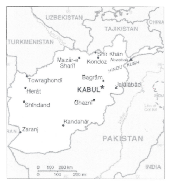
Kandahar 250 miles from Kabul (AED HQs). Due to current road conditions, it is an 8-10 hour drive.

The Afghanistan National Army (ANA) had little to no infrastructure prior to the U. S. led coalition's invasion of Afghanistan. The Office of Military Cooperation - Afghanistan (OMC-A), the Afghanistan Engineer District (AED), and selected contractors are building the ANA an infrastructure throughout Afghanistan to provide a military presence to ensure security and stability. The ANA infrastructure will consist of ANA brigade sites located throughout Afghanistan. I am going to tell you about one site in particular located in Kandahar.