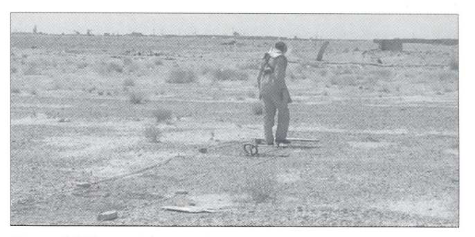
One of Minetech's deminers is clearing an initial lane. Minetech is the subcontractor to the prime contractor responsible for demining. This particular team is from Zimbabwe, Africa.

A parallel priority to temporary camp construction was demining certain areas of the permanent camp to allow construction to begin while the demining continued in other areas. The first locations for demining were for the prime power plant and the waste water lagoons. (The waste water lagoons are a smaller part of the sewage collection system.)