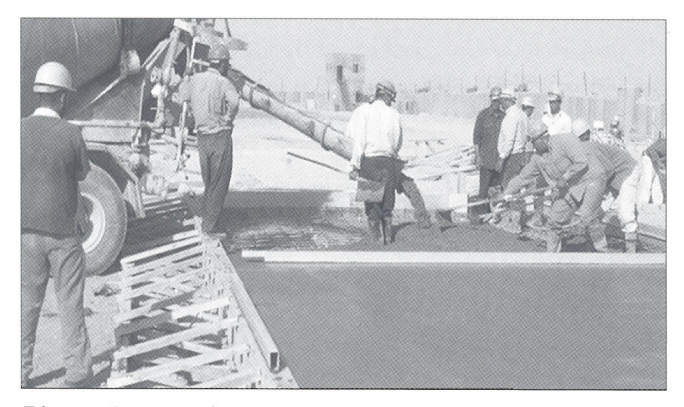
Pictured above is one of the slabs needed to construct the temporary camp. This particular slab is for a prefabricated metal housing unit.

The units in the temporary camp were manufactured by a Turkish company called Mega. The completion date for the temporary camp is October 27, 2004 (60 days from award). At the time of this article, the ANA brigade Kandahar temporary camp was 50% complete.