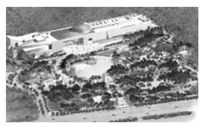
The bird's-eye view of the National Museum of Korea which is scheduled to open in Yongsan in October, 2005.