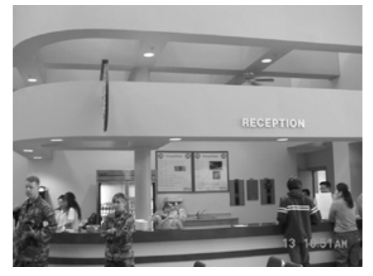
Reception desk at Wolf Pack Fitness Center