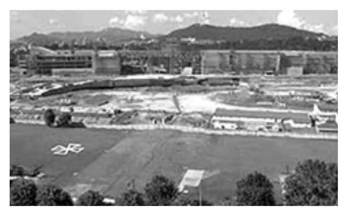
The USFK helicopter pad in Yongsan was located right next to the National Museum of Korea under construction.

After almost seven years of negotiations on the relocation of the helicopter pad, Seoul and Washington finally agreed in May 2004 to move it a