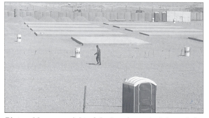
Pictured here are eight of the housing unit slabs and the two office unit slabs

A parallel priority to temporary camp construction was demining certain areas of the permanent camp to allow construction to begin while the demining continued in other areas. The first locations for demining were for the prime power plant and the waste water lagoons. (The waste water lagoons are a smaller part of the sewage collection system.)