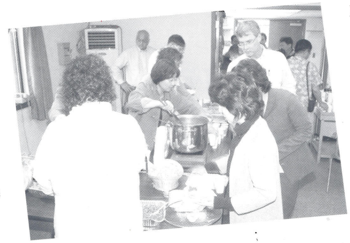
It is time to eat: "Enjoy the food and enjoy the culture."

Do you know who the first Hispanic was to