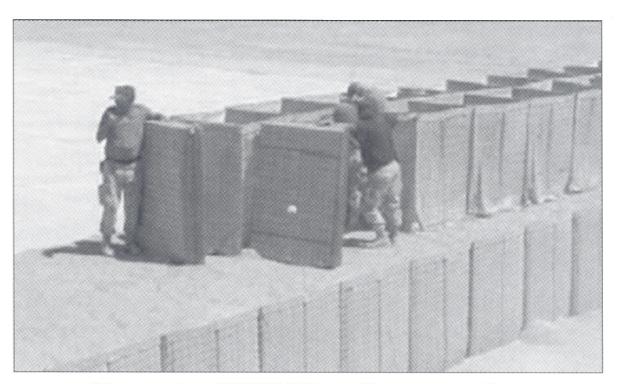
Example of HESCO wall construction

The first goal was to have an immediate presence to supplement the coalition forces already on the ground. A HESCO camp was hastily constructed to provide an area for the ANA soldiers to conduct operations. A HESCO is basically a 4' x 4' x 4' fabric lined wire framework that is filled with dirt and rocks to provide blast protection.