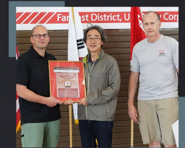
The Engineering Division Employee of the Year 2021