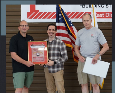
The Support Staff Employee of the Year 2021

III Marine Expeditionary Force (III MEF) Forward Headquarters (MAGTF Operations Center), Camp Mujuk