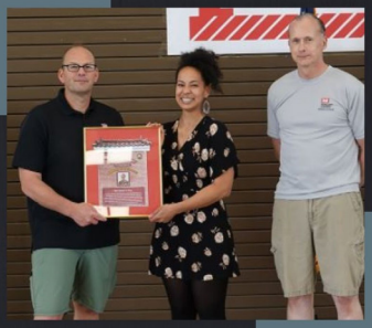
The District Employee of the Year 2021