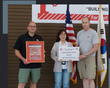
The Administrative Employee of the Year 2021