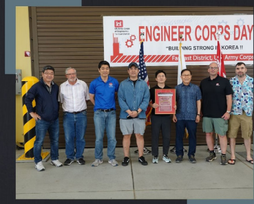
The Project Delivery Team of the Year 2021

III Marine Expeditionary Force (III MEF) Forward Headquarters (MAGTF Operations Center), Camp Mujuk