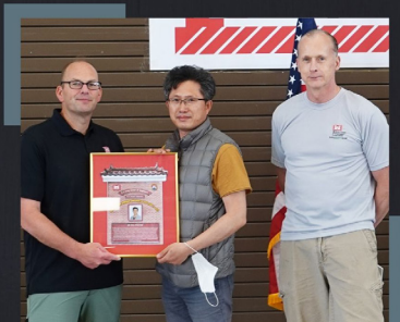
The Contracting Division Employee of the Year 2021