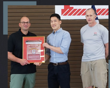
The Programs and Project Management Division Employee of the Year 2021