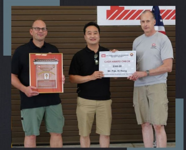
The Construction Division Employee of the Year 2021