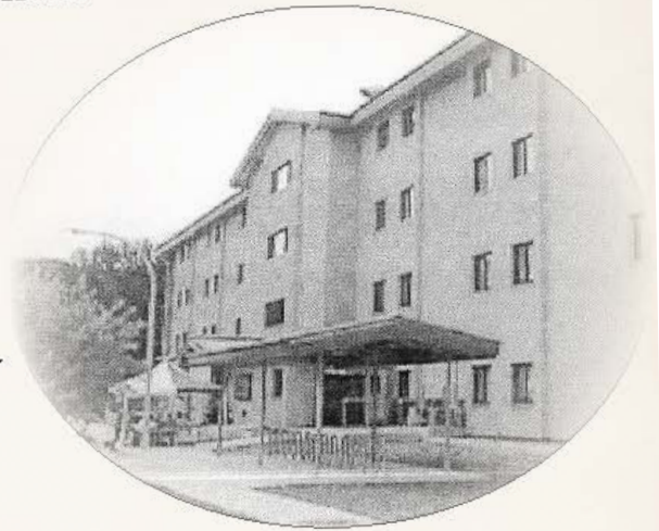
Combined Defense Improvement Program barracks at K-16 completed, July 27, 1999.