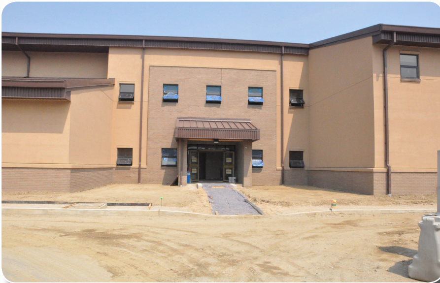
Engineers at the Far East District's Central Resident Office at Osan Air Base continue to provide construction surveillance on many projects. One of which is the Special Operations Command Korea facility which includes an administrative area, group operations center, vehicle storage building and a parachute drying tower that is 122 feet tall. The facility will support USFK ground and air component commander's requirements and joint special operations with Republic of Korea forces. The facility is more than 60 percent complete and is scheduled to be finished by the end of the year.