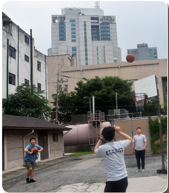
The U.S. Army Corps of Engineers, Far East District, held its final Engineer Day at the district headquarters, June 29 as it prepares to relocate to Camp Humphreys. Many competitive activities filled the compound including an egg-spoon race, free-throw competition, spades tournament, pull-ups, and much more.