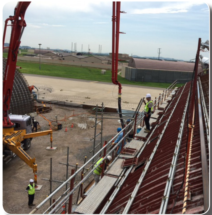
Far East District Kunsan resident office engineers inspected concrete placement of a hardened aircraft flow through shelter Aug. 1. Concrete placement for this project requires 110 trucks of concrete which takes around 18-20 hours. A total of 10 shelters will be constructed at Kunsan Air Base.