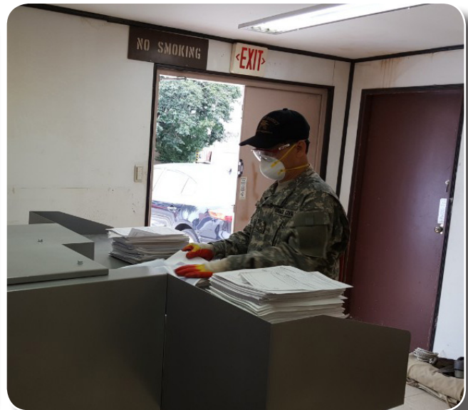
In continued support of the district's relocation efforts supply branch personnel are conducting inventory and affixing bar tags to all FED Compound furniture. The Supply Branch is expected to complete the inventory of all furniture before the motor pool begins the relocation to Camp Humphreys in early 2018. Additionally, in order to reduce the amount of materiel and documents during the relocation to Camp Humphreys, supply and facilities personnel are shredding unneeded documents. This effort is monumental in that there are decade's worth of documents to be shredded. Every division and office in FED will continue to coordinate with the supply branch to destroy outdated records prior to relocation to Camp Humphreys.