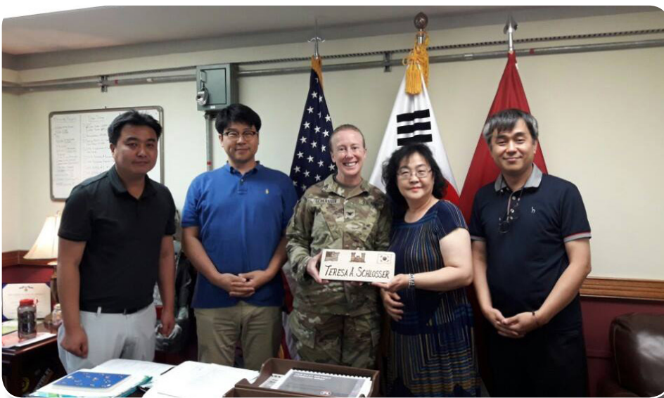
Far East District (FED) commander Col. Teresa Schlosser was presented a wooden name plaque from the FED Korean nationals employees union representatives Aug. 4. FED's total workforce numbers about 500, and over 250 are Korean nationals. Together we are building strong in Korea.

http://www.census.gov/newsroom/facts-for-features/2015/cb15-ff18.html