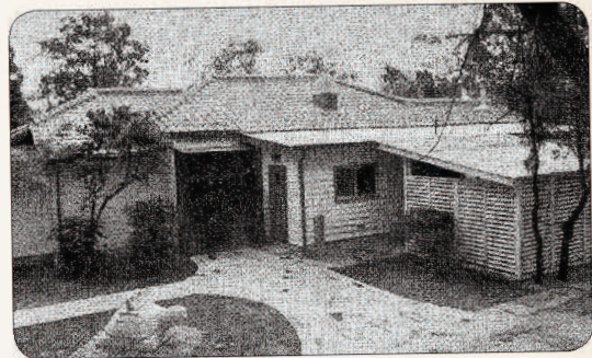
US Navy Chief Petty Officers' Club at Chinhae Naval Base

- 2011: Daegu High School at Camp Walker and Camp Casey Elementary School opened.