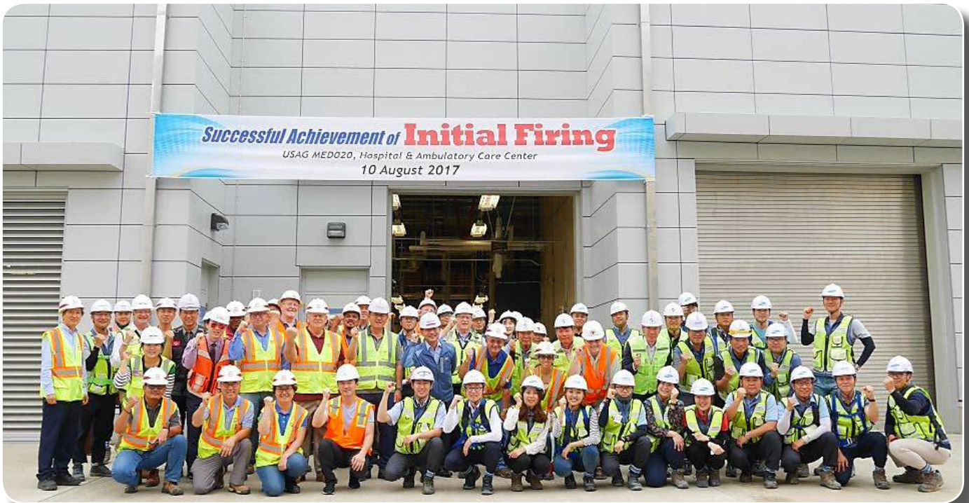
Members of the Far East District Korea Program Relocation Office, Medical Resident Office, Ministry of National Defense U.S. Forces Korea Relocation Office (MURO), Health Facility Planning Organization, and Samsung gathered to celebrate the firing of the boilers to celebrate the achievement of an important milestone for the Camp Humphreys hospital project, Aug. 10. This milestone is significant because the operational boilers are necessary to be able to continue with the work on the interior of the hospital and the Acute Care Center throughout the winter.