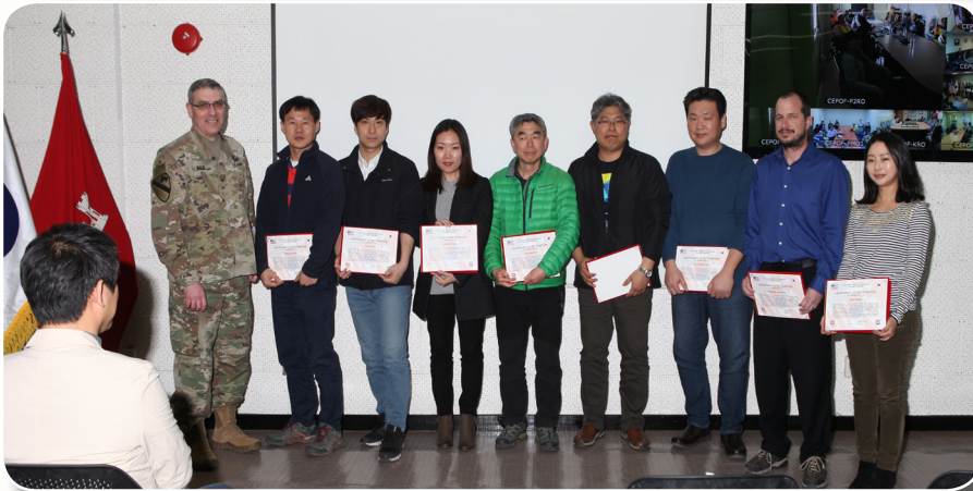
Far East District's nomination for the U.S. Army Corps of Engineers Project Delivery Team of the Year is our U.S. Forces Korea Operations Center Project Delivery Team. The USFK Operations Center project is one of the most important facilities contained within the Korea Relocation Plan. The project delivery team was nominated to represent the district for overcoming numerous obstacles to achieve the great success to date with the award of the final contract in April 2017.