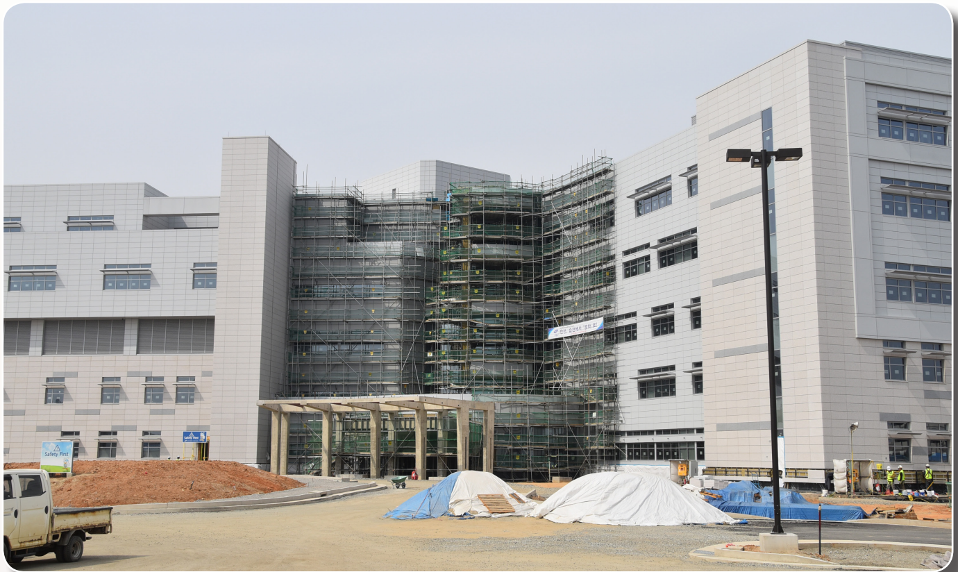
Hospital and Ambulatory Care Center/Dental Clinic at USAG Humphreys is scheduled to be completed in June 2018.