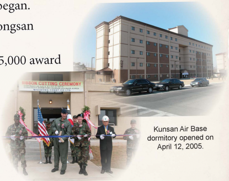
Kunsan Air Base dormitory opened on April 12, 2005.

- 2012: Construction of the new Operations and Aircraft Maintenance Unit Facility at Osan Air Base began.