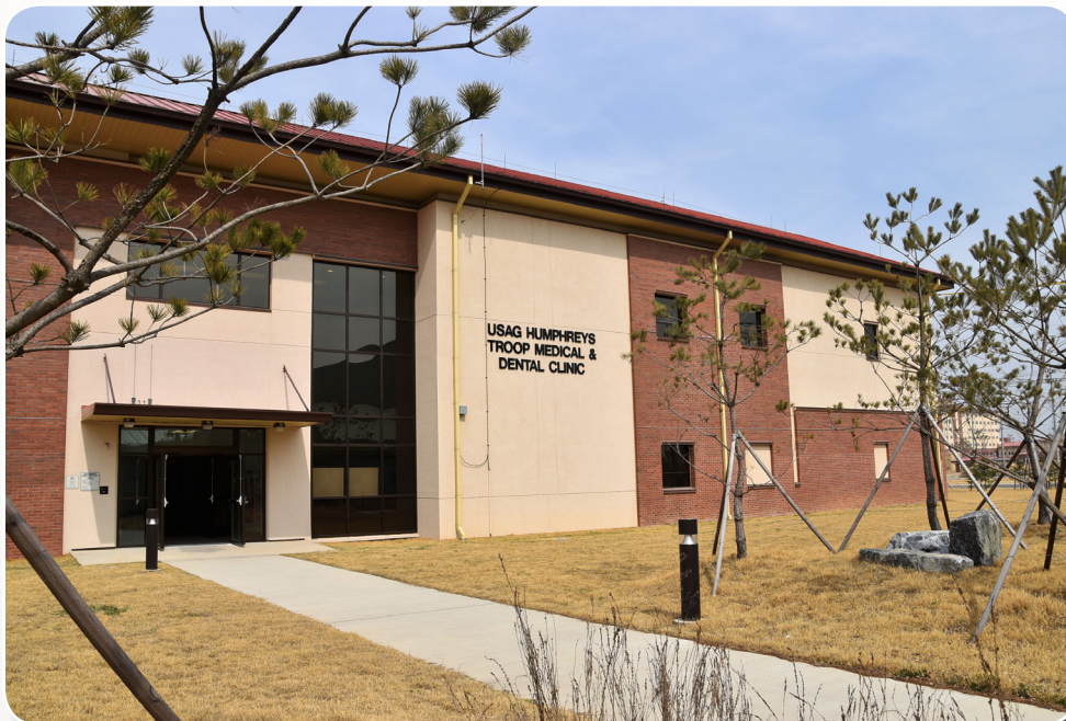
The U.S. Army Garrison Humphreys MEDS 50 Troop Medical and Dental Clinic was transferred and signed as real property to USAG Humphreys Department of Public Works, effective March 24. The project was completed thanks to the efforts of the Medical Resident Office.