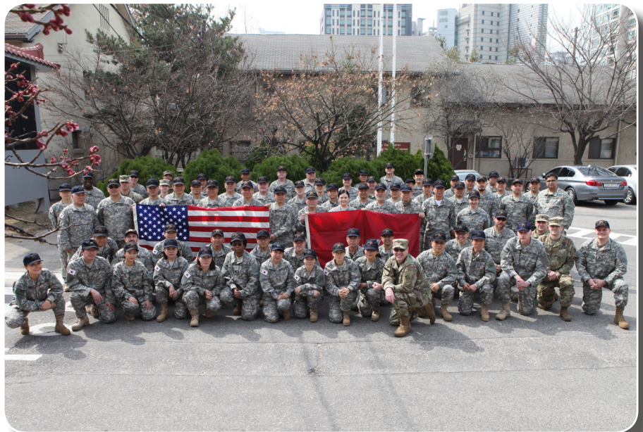
Far East District Emergency Essential Civilians (EEC), Mission Essential Competencies (MEC), and military personnel pose at the district headquarters in military uniform in support of the U.S. Forces readiness exercise Key Resolve March 23.