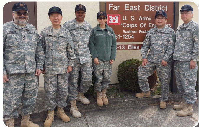
Far East District Emergency Essential Civilians (EEC), Mission Essential Competencies (MEC), and military personnel are in uniform and ready to support the U.S. Forces readiness exercise Key Resolve.