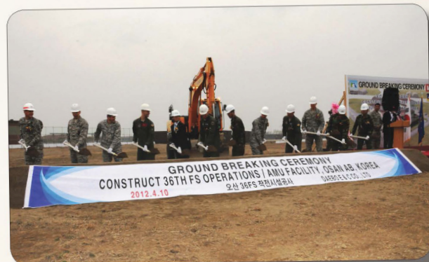
The distinguished guests broke ground on the new Operations and Aircraft Maintenance Unit Facility at Osan Air Base, April 10, 2012.