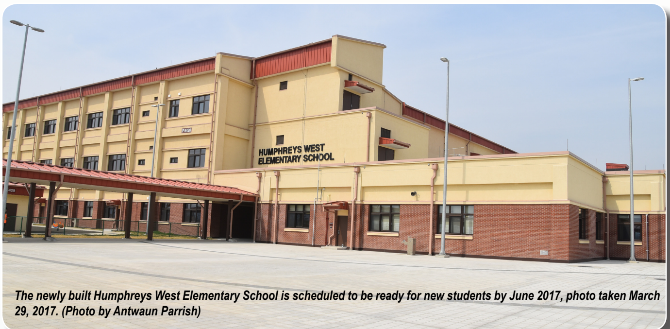
The newly built Humphreys West Elementary School is scheduled to be ready for new students by June 2017, photo taken March 29, 2017.

The school is scheduled to be ready for students by June 2017.