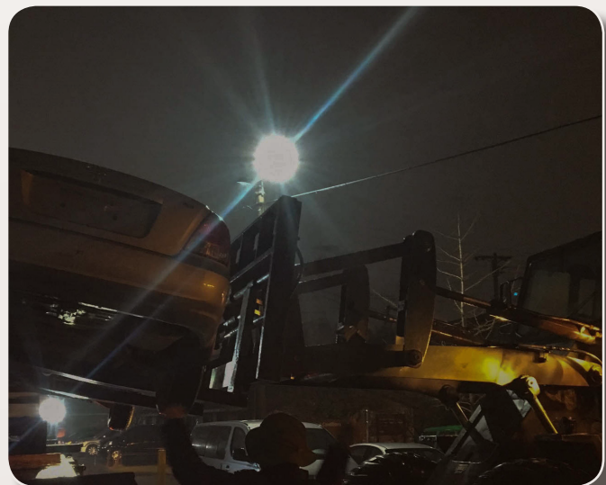
FED motor pool employees load vehicles onto tractor-trailers, of the 25th Transportation Battalion, for obsolete vehicle turn in to the DRMO, April 6. The obsolete vehicles were loaded by forklift, tied down and departed the compound in about an hour.