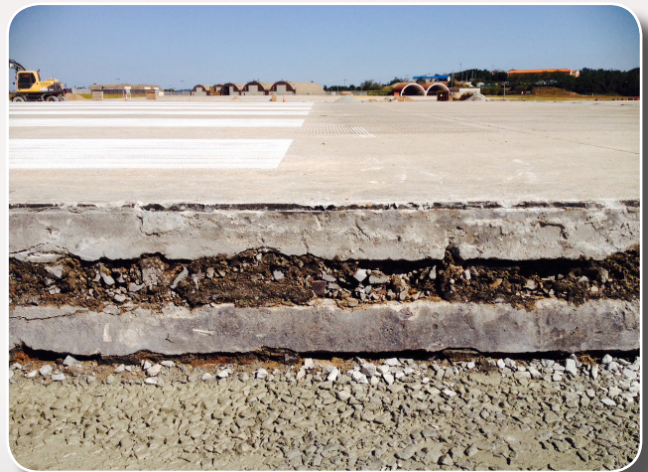
(above) An unbounded 8 inch overlay was constructed on top of the original runway in 1962. (FED file photo)

(below) Contractors from Yi Bon Construction Company LTD., apply a compound to prevent the loss of moisture while the concrete is curing on the Kunsan Air Base runway. If the concrete is exposed to air during the curing process, it will lose moisture and the compressive strength of the concrete will be reduced. (FED file photo)