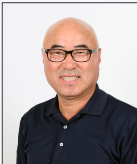
Chang Shin Construction Came from Bothell, Wash.