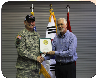
George Ward Construction 35 Years of Service Award