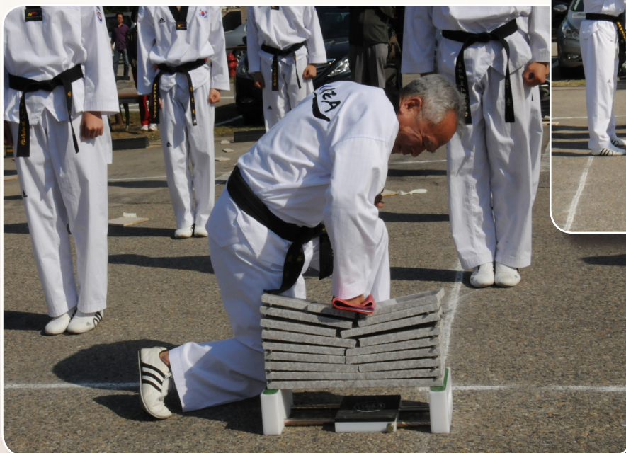
The U.S. Army Corps of Engineers Far East District held their annual sports day Oct. 17. District employees competed in games such as arm wrestling, badminton and basketball and witnessed a special performance by the Korean National Taekwondo Demonstration Team.