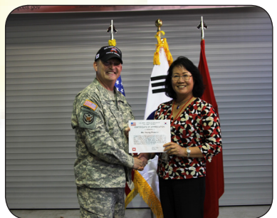
Young Phoenix Resource Management Certificate of Appreciation