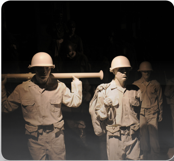
Sculptures of American Soldiers during the Battle of Osan as seen at the United Nations Forces First Battle Memorial Museum.

Staff rides are official military events, steeped in tradition. Their aim is to preserve the institutional memory of the Army, provide historical support in decision making, military history instruction and support leadership and professional development in enhancing unit pride and esprit de corps.