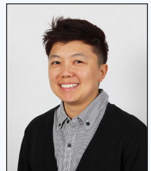
Tok Im Executive Transferred to LA District