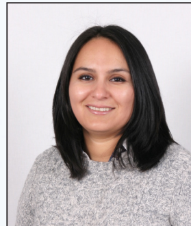
Flor Vega Construction Transferred to Fort Worth District