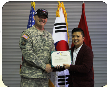
Tok Im Executive Certificate of Achievement