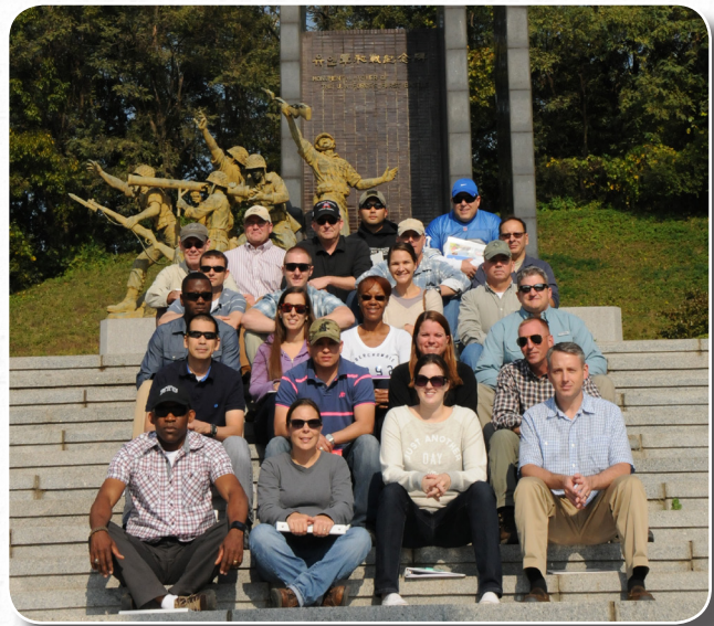
Soldiers from the Far East District gather together for a group photo during their visit to the grounds of the Battle of Osan and Suwon Fortress.