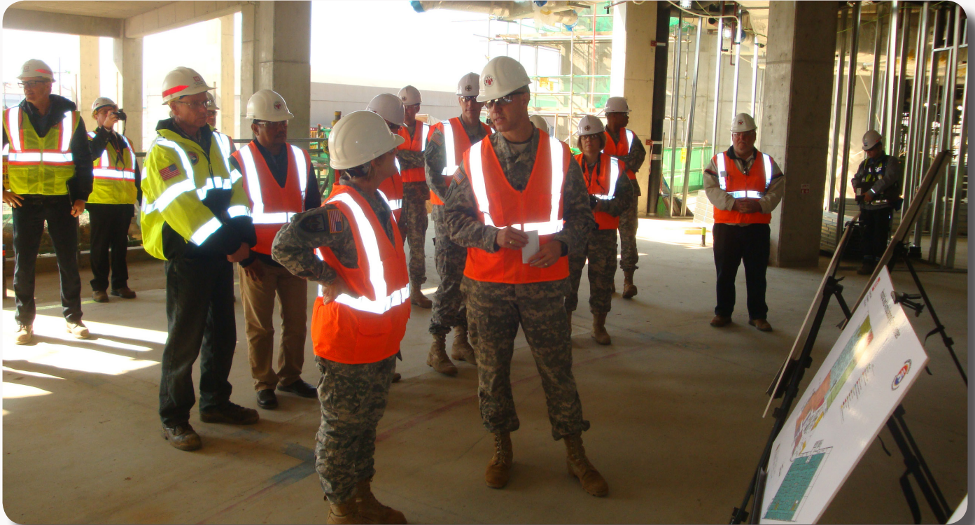
Lt. Gen. Patricia Horoho, Army Surgeon General and Commanding General, U.S. Army Medical Command visited the future site of the hospital and ambulatory care center at U.S. Army Garrison Humphreys Nov. 5. The completed medical campus will be able to support 65,000 beneficiaries and 5,000 annual inpatient admissions.