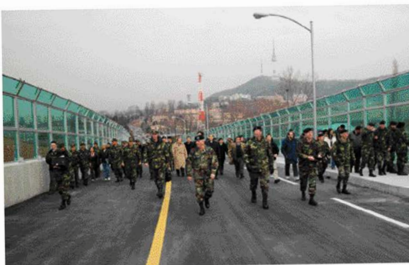
Ribbon Cutting dignitaries and attendees are the first to walk across the new overpass at Yongsan following the ribbon cutting.

The new overpass will significantly reduce the rush hour traffic jams on a main Seoul street that passes between the two sides of Yongsan Garrison.