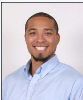
Kenith Ward Construction Came from Augusta, Ga.