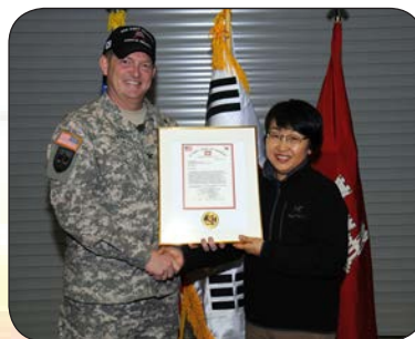
Song Bliss Information Management Employee of the month for October