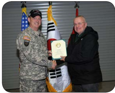
Basil Meyer Construction 30 Years of Service Award