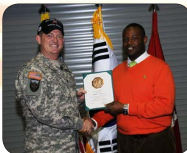
Robert Medlock Construction 10 Years of Service Award