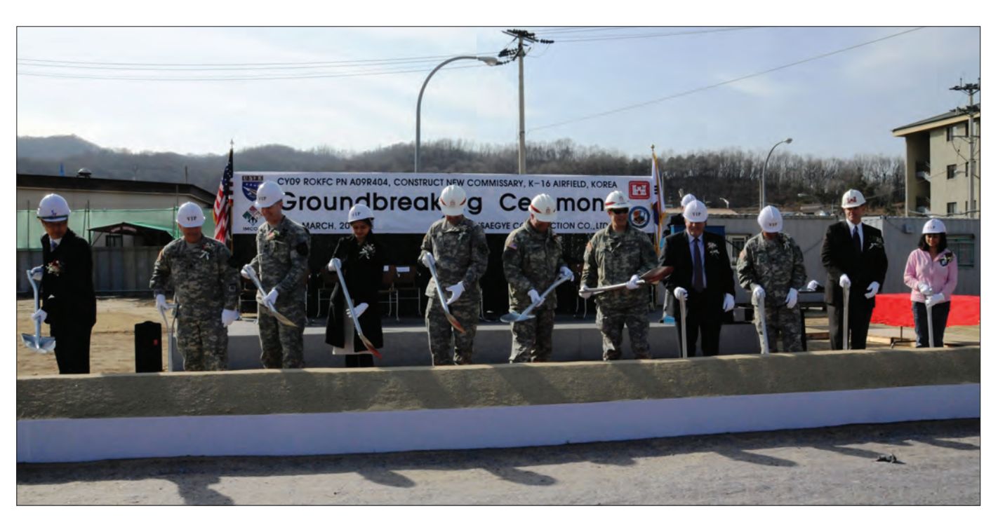
Representatives from the various organizations who played a part in bringing a commissary to K-16 Airfield prepare to break ground on the new facility March 22.

The facility, scheduled to be completed April 2012, will be about 8,100 square feet and will have all of the amenities found in any other commissary throughout Korea including cold and freeze storage, electronic checkout area, parking, sidewalks, and canopy.