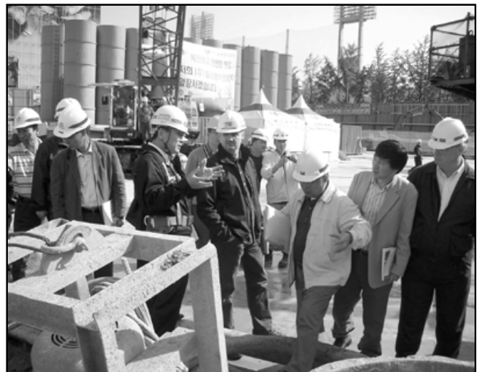
The Far East District employees visit the construction site of the Good Morning City Shopping Mall located just outside the FED compound.