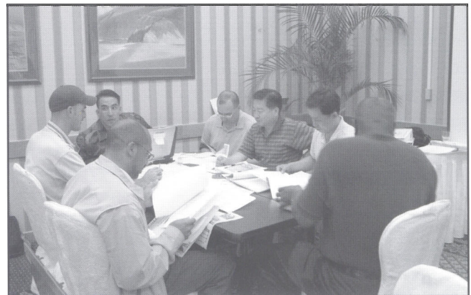
Participants, representing a number of commands, team and discuss various aspects of security engineering at the Dragon Hill Lodge on Yongsan.

Mortar defense is also important for safety and protection from standoff weapons, ballistic weapons, and rocket propelled grenades.