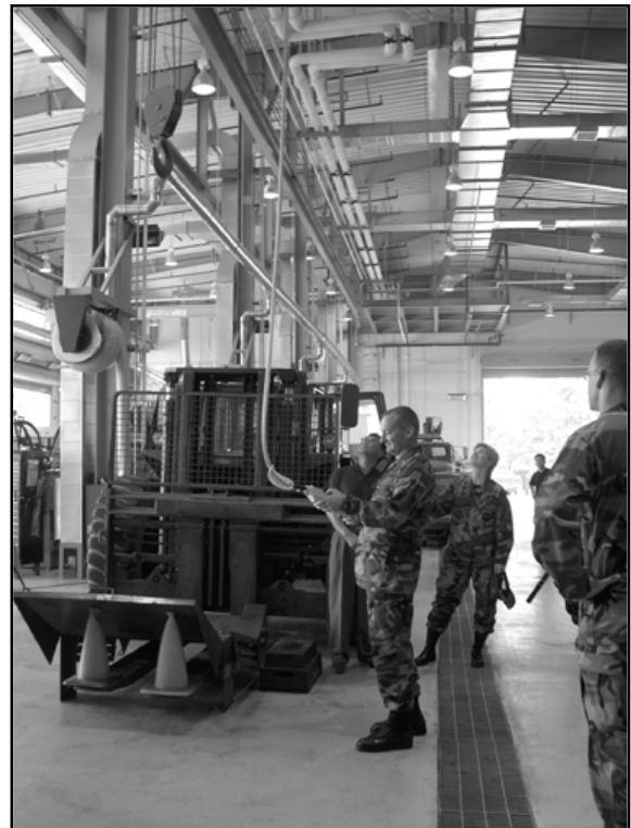
(Above) Brig. Gen. Joseph Reynes, 51 st Fighter Wing commander, takes control while other dignitaries look on during a tour of the new vehicle maintenance facility in Osan Air Base (left).